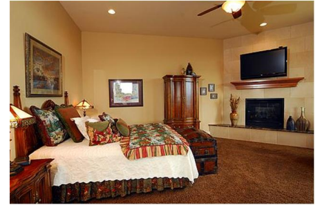
Sleeping Area of Master Suite with Chipped Marble Fireplace and Massive Windows to Views