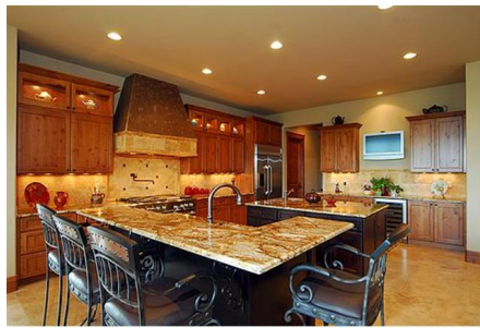
Gourmet Kitchen Breakfast Bar and Food Preparation Island