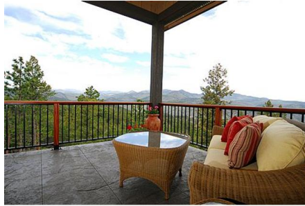
Master Suite Private Covered Stamped Concrete Porch with Massive Views of Mountain, Foothills and Sunsets