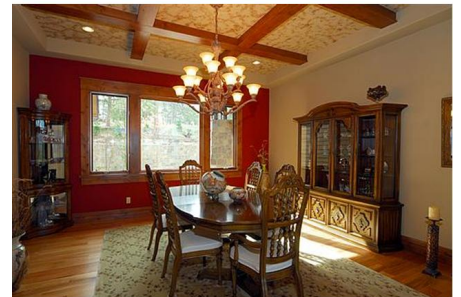
Dinning Room Open to Views through Great Room