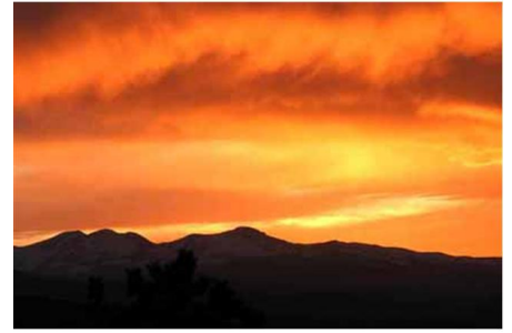
Another Actual Sunset from Home - Changes Daily