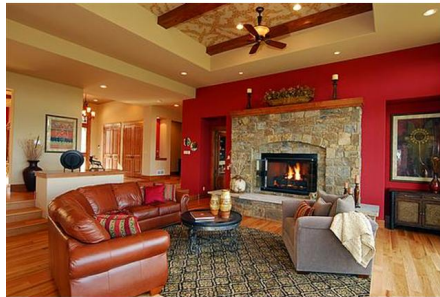
Great Room Fireplace