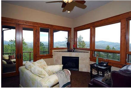
Sitting Area of Master Suite with Massive Windows to Views, French Doors to Covered Stamped Concrete Porch and Wet Bar