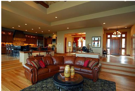
Sunken Great Room Open to Kitchen, Dining Room and Front Entry