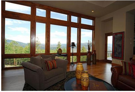
Great Room Massive Window and Door to Stamp Concrete Patio with Stairs to Lower Level Flagstone Patio