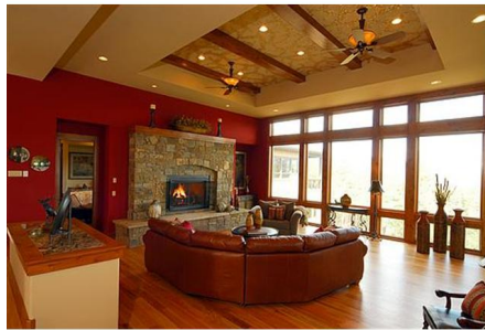
Sunken Great Room with Massive Window to Snowcapped Views and Beautiful Vaulted Ceilings