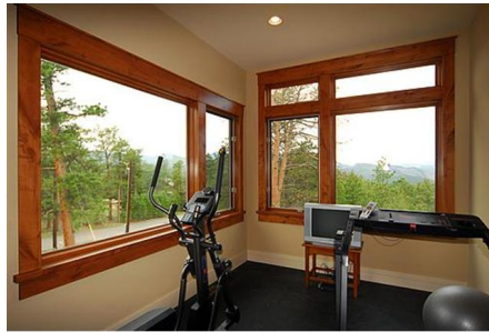
Master Suite Workout Room with Spectacular Views of Snowcapped Mountains.