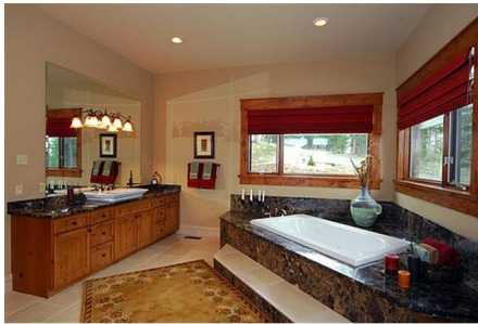
Grand Master Bath with Large Steam Shower, His/Her Vanities and Jetted Tub