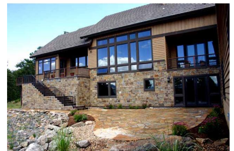
Magnificent Flagstone Patio with Access to Game Room and Stairs to Patio with Access to Great Room and Eating Area of Kitchen