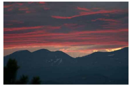
Another Actual Sunset from Home - Changes Daily