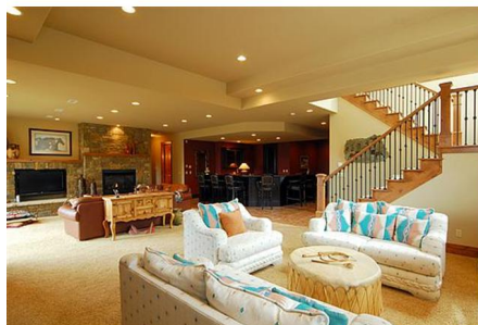
Sitting Area of Game Room with Fireplace and French Doors to Magnificent Flagstone Patio