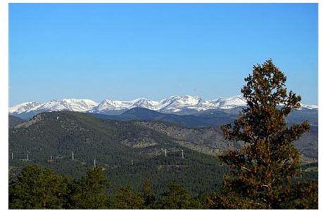
Actual View from Almost Every Room in the Home - Continental Divide