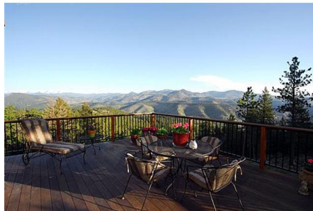
Tigerwood Deck Off Eating Area of Kitchen - Massive Views of Mountain and Foothills