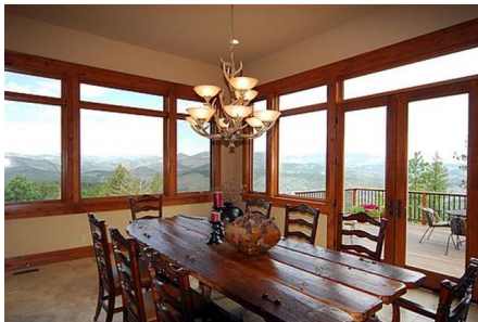
Sunken Eating Area of Kitchen with Massive Window to Mountain and Sunset Views - Opens to Large Tigerwood Deck