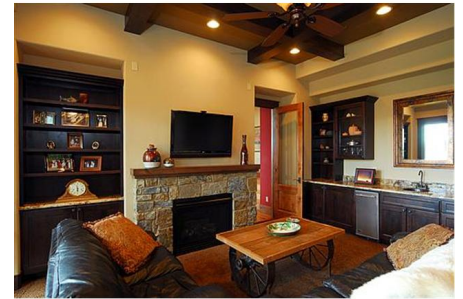
Unique Library with Fireplace, Wet Bar and Private Stamped Concrete Covered Viewing Patio