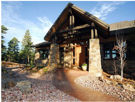
Magnificent Front Entry