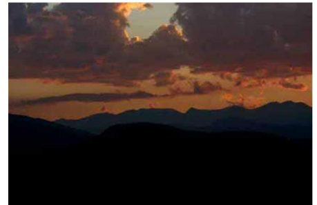
Ever Changing Natural Beauty of Actual Colorado Sunsets from Home - Changes Daily