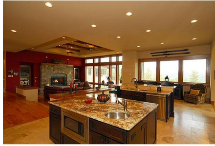
Gourmet Kitchen Open to Great Room and Magnificent Snowcapped Views